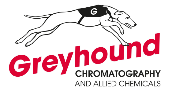
Q-Fil Certificate of Conformance

As a trusted name in the supply of chromatography consumables and certified reference standards, Greyhound also offers a comprehensive selection of top quality own brand products including Capillary columns HPLC columns, Syringe Filters, Consumables etc. This catalogue contains details of our range of Q-Fil Membrane Filters. Other product catalogues are available on request. These quality products are backed by the